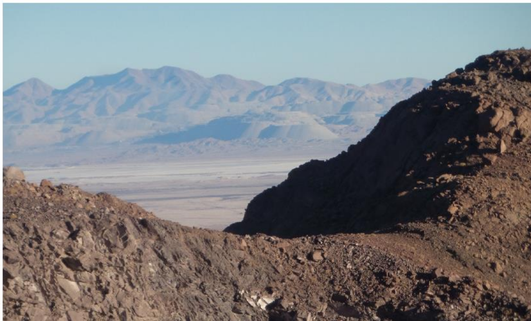
View of Chuquicamata Mine dumps from Tuina