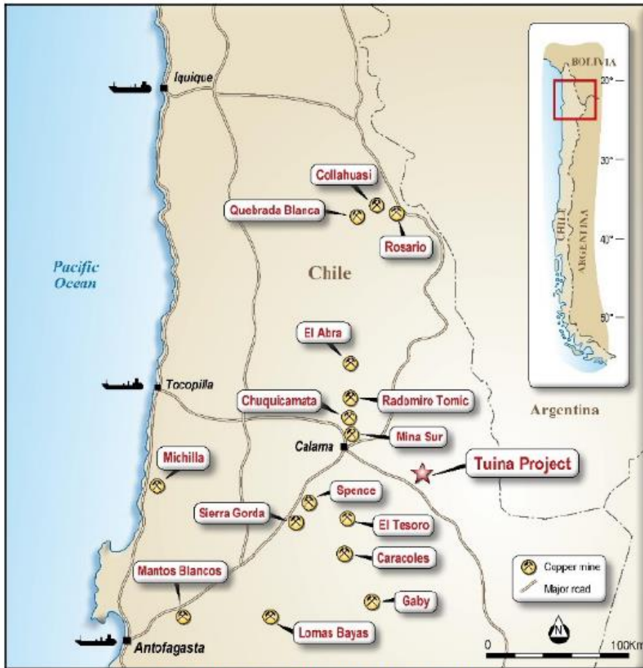
Location of Tuina Project in Chile