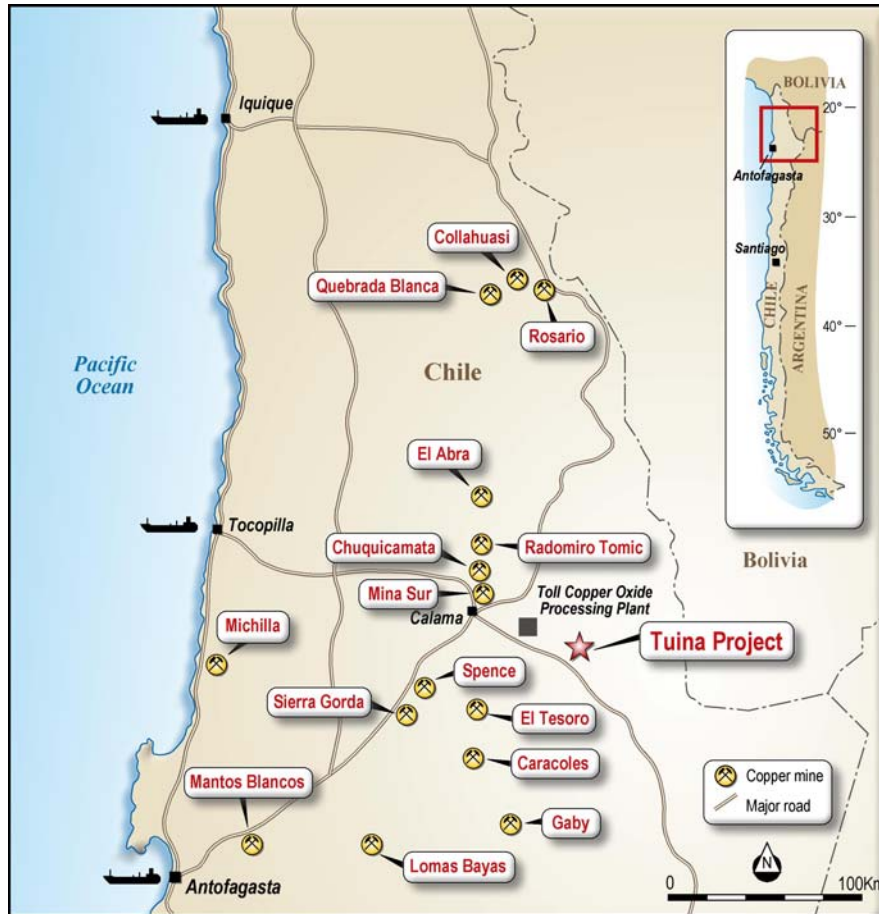
Figure 4 Location of Tuina Project