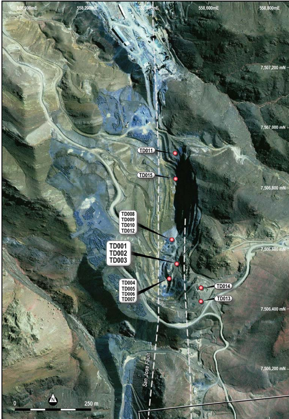
Figure 1 Location of diamond drill holes along San José Fault

Assay results for the first three drill holes have now been received and are shown in cross section in Figure 2 and in longitudinal section in Figure 3. Assay results for the remaining holes are still awaited.