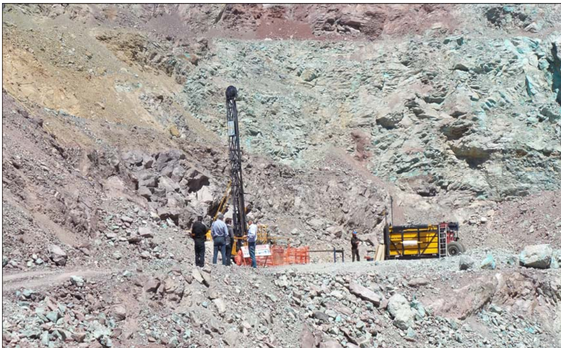
Figure 5 Drilling at San Jose open pit